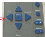
Braille Key Pad